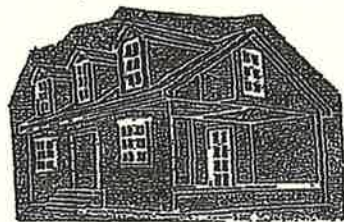
"Builders build new houses. Families build homes." trac