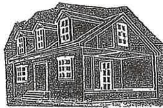
“Builders build new houses. Families build homes.” tmc