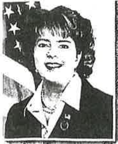
State Senator Michele Brooks 50th District

100 Hadley Rd-Suite 9 Greenville PA 16125 724-588-8911 800-457-2040